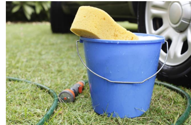
Washing the car on a grassy area allows wash water to soak into the ground, not enter a storm drain.