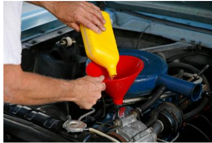
An estimated 180 million gallons of used oil is improperly disposed of each year!