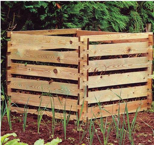
A compost bin is easy and inexpensive to build and will provide you free organic fertilizer!

Yard waste in the storm drain system causes many problems for our communities. Debris placed or washed into a storm drain can cause flooding; damage to the system if caught in culverts or pipes; and create algae blooms, fish kills and unpleasant odors as it decomposes in water.