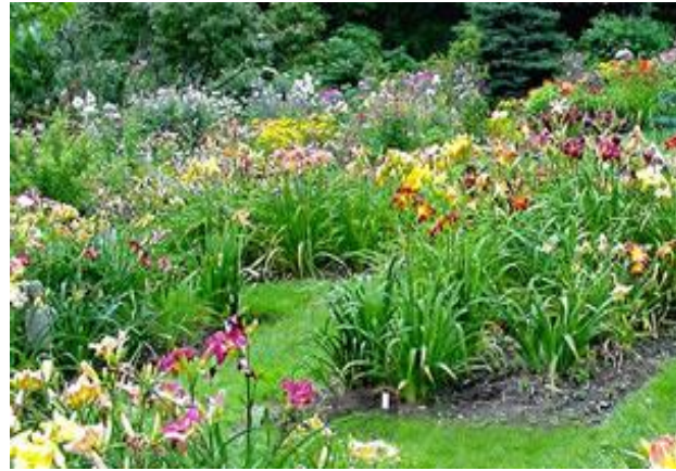
You can grow a beautiful yard and garden and still do your part to protect water quality in waterways!

A green lawn and blooming garden make your home more beautiful and increase your property value. Using fertilizers, pesticides and weed killers are a great way to help you achieve this look, especially when you read and follow the package directions. However, using too much of a lawn and garden product or not correctly disposing of any excess can turn helpful products into harmful pollutants if they enter local waterways.