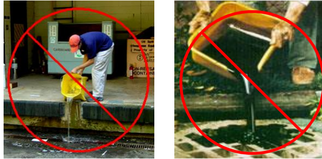
Pouring dirty wash water or used motor oil into a storm drain grate is an illicit discharge

An illicit discharge is anything besides stormwater that enters the storm drain system. It can be intentional or unintentional, but it is illegal for anything but stormwater to enter the storm drain system. A few exceptions to the law are listed in this brochure.