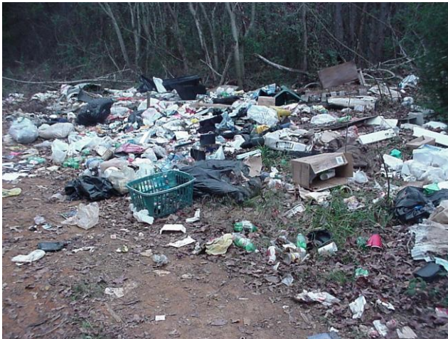
Improper disposal causes poor water quality and is unlawful in Jefferson County!

Improper disposal occurs when people do not properly discard trash, yard and household chemicals, debris, and other materials that they do not want. Instead, they improperly dump it in a location where it comes in contact with stormwater and enters the storm drain system. Local ordinances prohibit dumping.